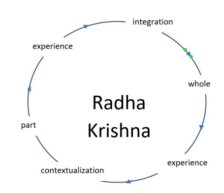
Figure 3: Hermeneutic Circle with Vaishnava Center.