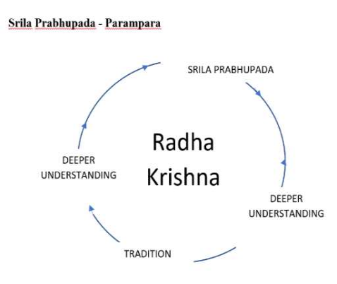
Figure 1: Hermeneutic Dynamic and Srila Prabhupada – Parampara.