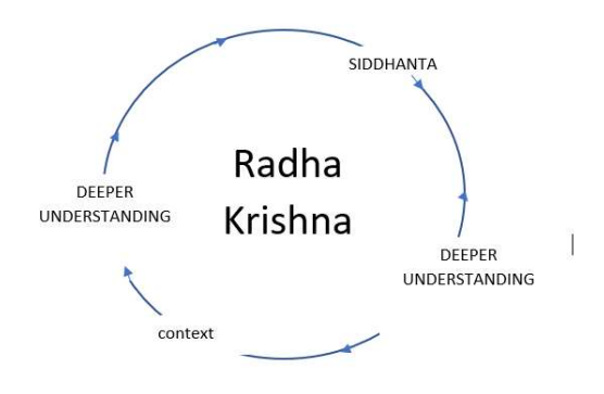
Figure 4: Hermeneutic Dynamic Conclusion of Vaishnava Doctrine and Place, Time and Circumstance (siddhanta and desa-kala-patra)

As expected, these injunctions are broad enough to serve as a frame of reference for interpretation of Vaishnava scriptures, regardless of time, place or circumstances; the dynamics between the work of an interpreter and siddhanta also form a hermeneutical circle as Figure 4 below attempts to show.